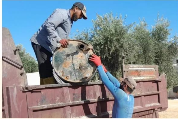
Mercy Corps repaired water systems to restore access to water (left) and provided sanitation and hygiene services by collecting and disposing waste (right) at a camp for internally displaced people.

Following assessments of short- and long-term needs, and with funding support