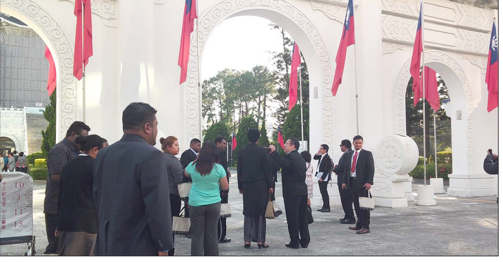
visit to Taiwan' s Cultural House.