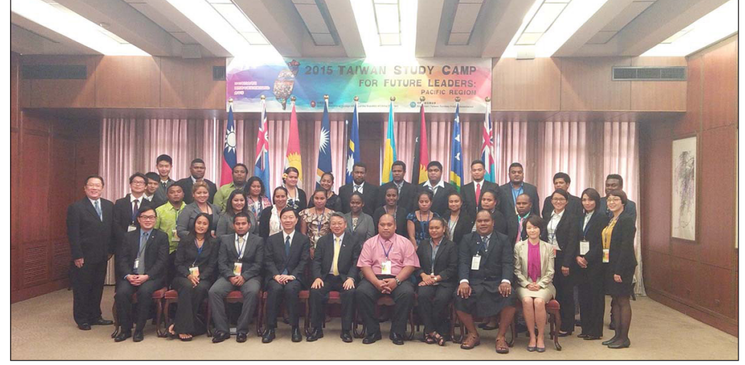
Participants pose for a group photo with officials from Taiwan' Ministry Foreign Office.

The camp aims to cultivate global perspectives, increase knowledge on Taiwan and foster friendship between participants.